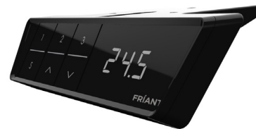
Digital display with three programmable presets

Friant MY-HITE adjustable tables integrate seamlessly within any Friant systems solution as well as private office applications.