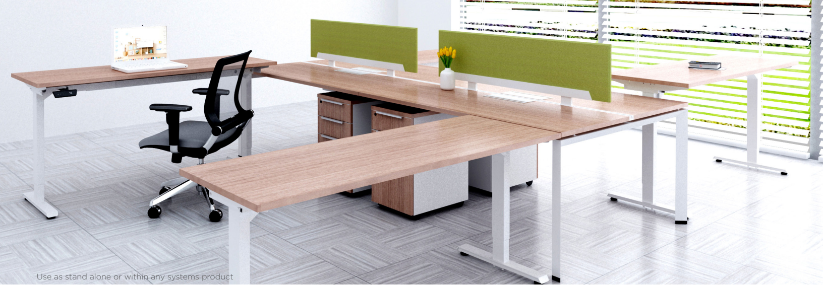
Use as stand alone or within any systems product